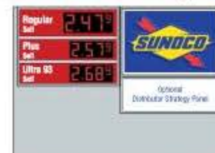
47.96 Sq. Ft.