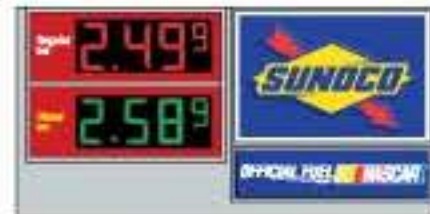
44.97 Sq. Ft.