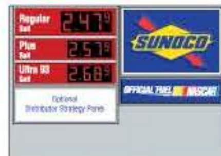
55.19 Sq. Ft.