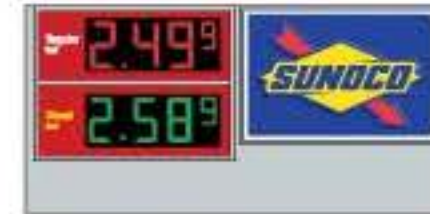
37.74 Sq. Ft.