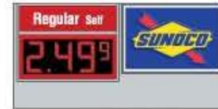
37.74 Sq. Ft.