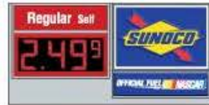
44.97 Sq. Ft.